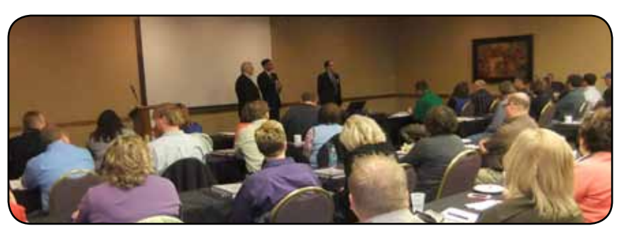
Forty-two cooperative representatives attended a Council-hosted workshop in March 2015 to learn about credit issues including a recent change by the Secretary of State to use a Unique Identifier Number system with Effective Financing Statement filings.

In March, the Council held a Credit Workshop for the purposes of presenting tips for successfully managing credit risks and updating the membership regarding pertinent credit issues. A portion of the workshop also addressed the recent transition by the Nebraska Secretary of State (SOS) to the personal Unique Identifier Number (UIN) system as it applies to Effective Financing Statement (EFS) filings. (Continued on page 10)