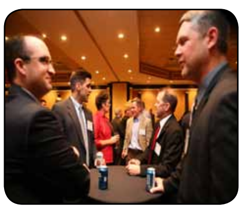
Following the Annual Meeting, the membership enjoyed time for fellowship over hors d'oeuvres and beverages.