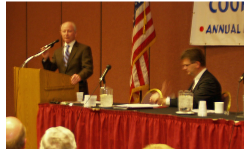
Senator Greg Adams (at podium) updated meeting participants about upcoming issues for the 2011 legislative session.