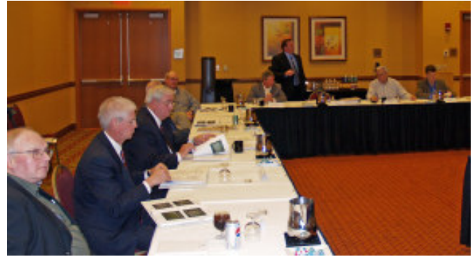
On March 9 th , the Council's newly-created Grain Indemnity Fund and Bond Study Review Committee held its first meeting.

and limits of the Iowa Grain Indemnity Fund.